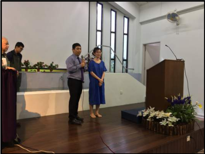
Pictured above is a lady with whom some of the members of the Jurong congregation had been studying. Thankfully she was baptized into Christ during the Lectureship (see photo bottom left).