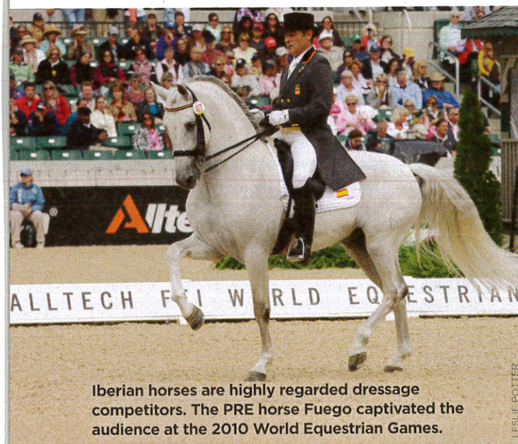
Iberian horses are highly regarded dressage competitors. The PRE horse Fuego captivated the audience at the 2010 World Equestrian Games.