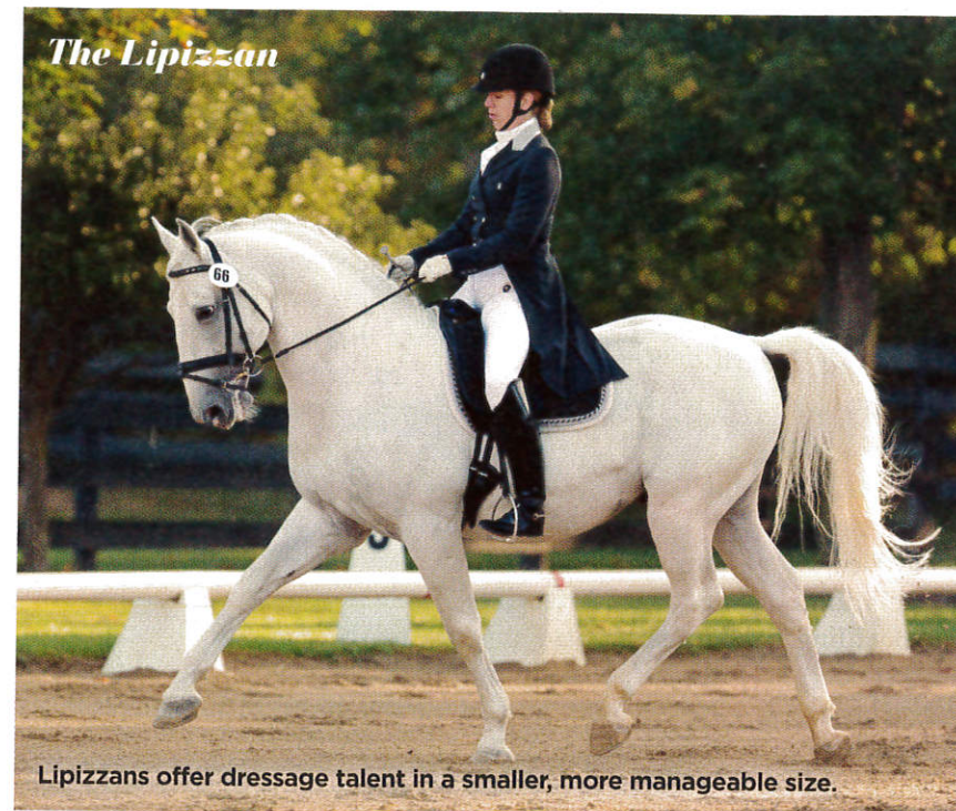
Lipizzans offer dressage talent in a smaller, more manageable size.