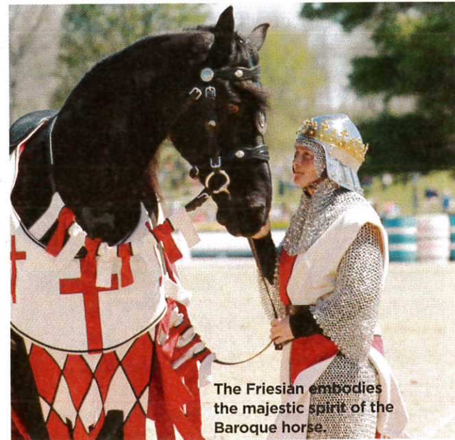
The Friesian embodies the majestic spirit of the Baroque horse.