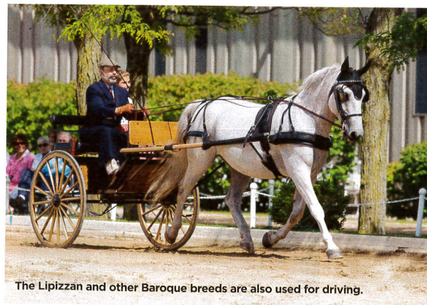
The Lipizzan and other Baroque breeds are also used for driving.

If you are looking for a sense of connection with your horse, Lipizzans aren't shy about human contact. "They are 'in your pocket' horses," says Phillips.