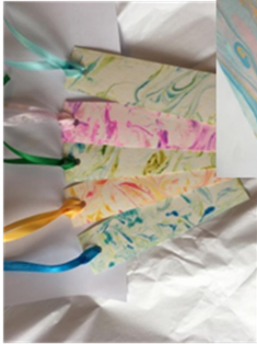
Marbled bookmarks and Treasure Box