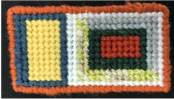
Needlepoint on Plastic Canvas