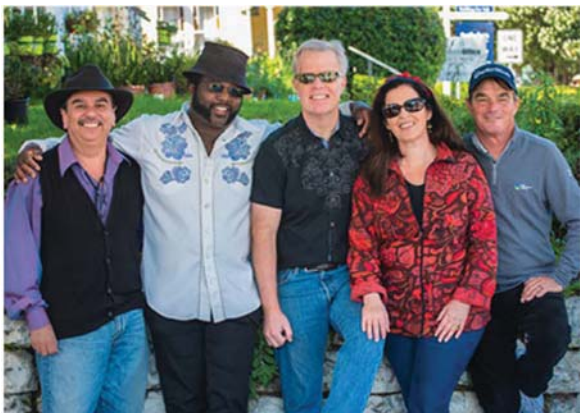
The Firefly Band