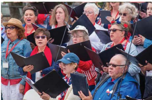
Monterey Peninsula Voices