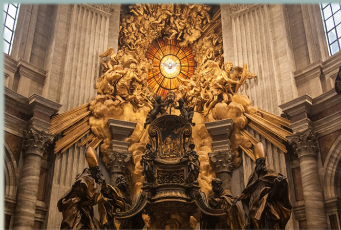
Chair of St. Peter the Apostle

To all who may have a sick relative at home, in rehab, hospital or nursing home please notify the Parish office 973-779-4330 so we can arrange a time to visit them.