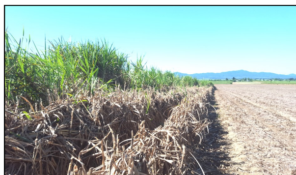
Block of Q250 with 4 long rows of cane taken out by Cockatoos, 2016

'Recreation wildlife harvesting licence' available on the Department of Environment and Heritage Protection. Must apply for this permit if you wish to eradicate problem Wallabies or Cockatoos.