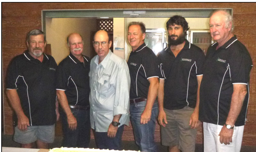
2015-2017 Innisfail Babinda Cane Productivity Services Board of Directors

This report has been put together to reflect and showcase our local industry in the year of 2017. This is not a replacement of the previous Productivity Reports , MSF will continue to produce the main Productivity Report but IBCPS will be releasing an annual report looking at our local Innisfail Babinda Cane farming districts and what went on for the previous year of 2017. IBCPS will use it as an opportunity to showcase our growers and industry bodies, and look forward to any grower or industry input for annual reports in the future. IBCPS hope you enjoy this report.