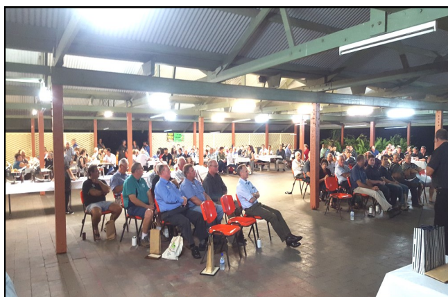
IBCPS Cane Productivity Awards Night, 2017

The 2017 Season Cane Productivity Awards Night, 2018 will be held on Thursday 24 th May 2018 . IBCPS look forward to seeing you all there again.