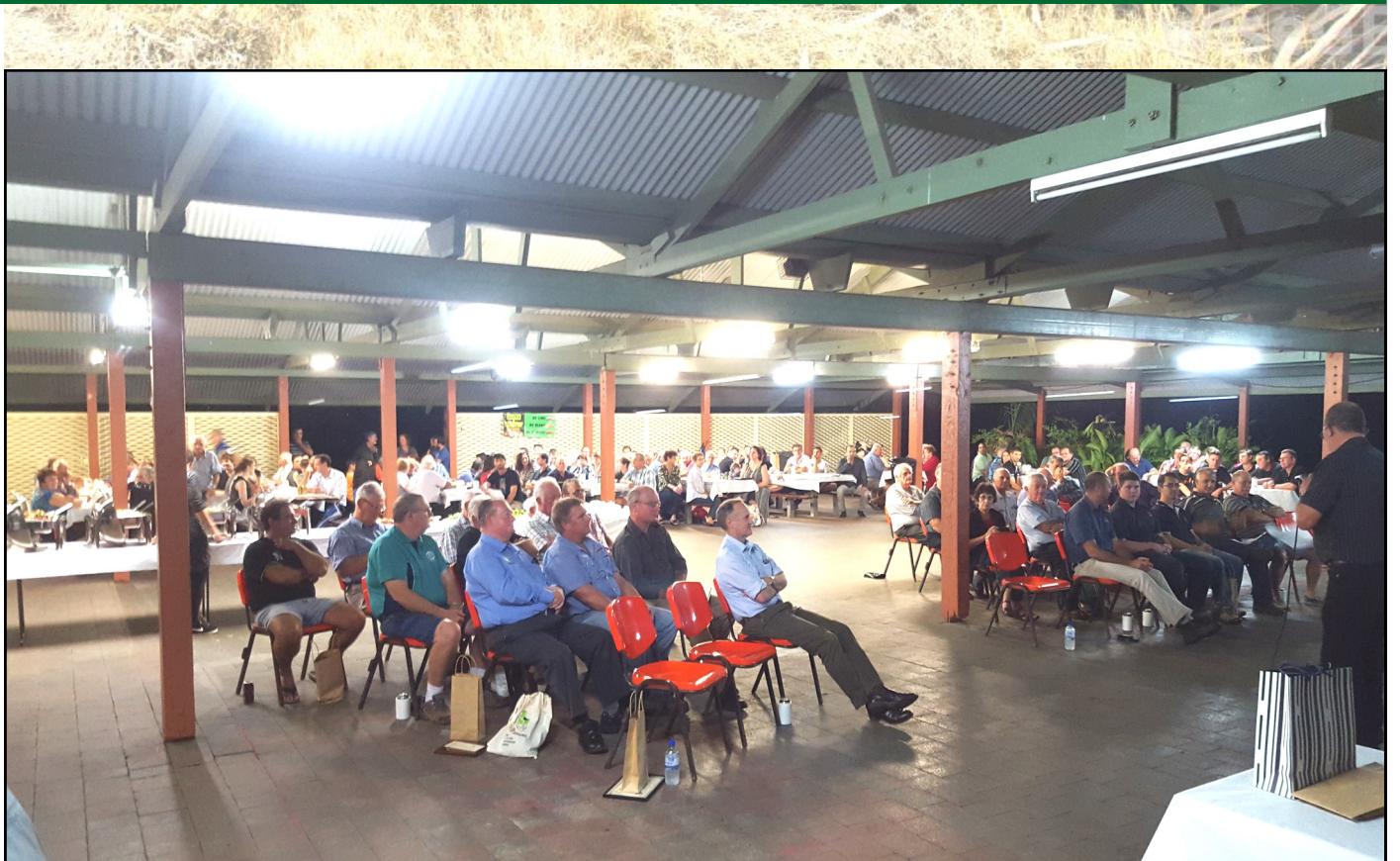
IBCPS 2016 Season Cane Productivity Awards Night, 2017