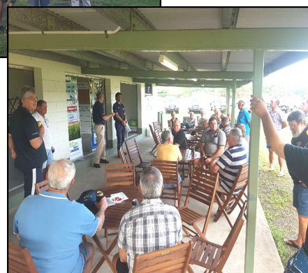
2017 IBCPS Christmas Trade Night; Babinda and South Johnstone Depots.