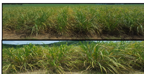
A case of suspected YCS in the Cowley area, 2017

For our region, YCS still remains a low risk to growers. For more information refer to the SRA website or the SRA newsletter updates, your local SRA adoption officer (Gavin Rodman) or IBCPS extension staff.