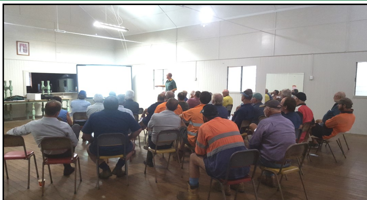
South Johnstone shed meeting, across all three shed meetings approx. 160 growers attended the update.