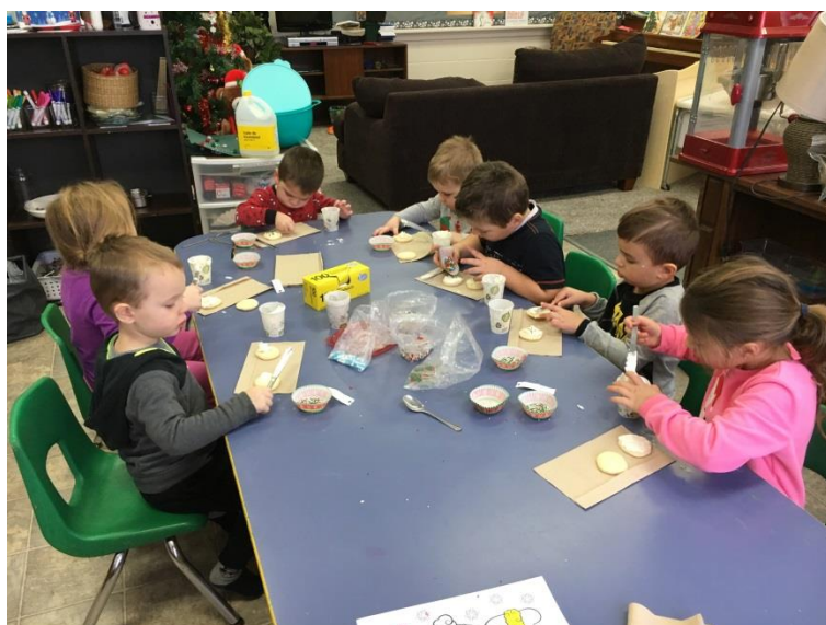
Making cookies for Santa