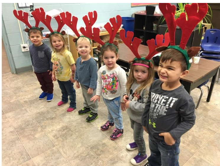
Practicing for the Christmas Concert