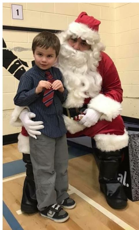
A visit with Santa