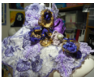
Gilded Cage collar