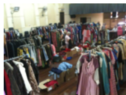
costume & clothing sale