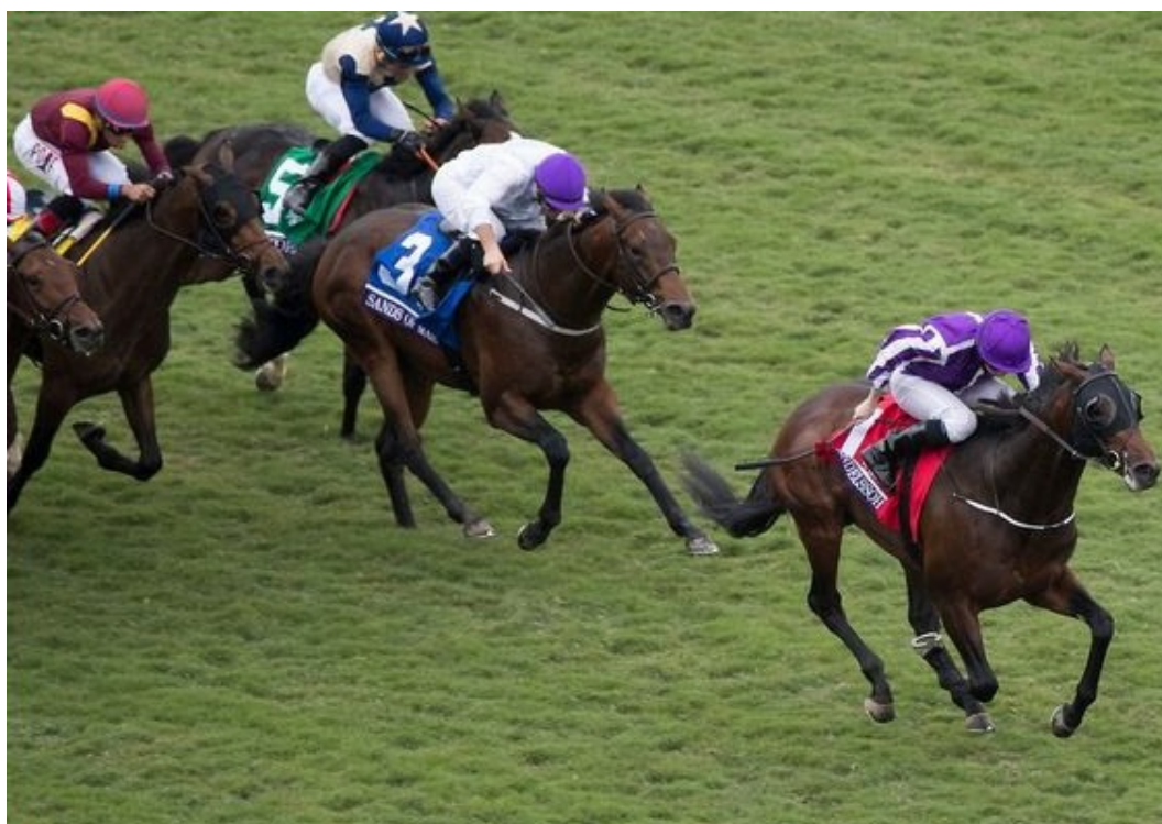
Mendelssohn winning the Breeders' Cup Juvenile Turf.

MENDELSSOHN , who was conceding five pounds (about 2.5kg) to his runner-up, stable companion Threeandfourpence, when making a winning reappearance in a Listed event at Dundalk three weeks prior to Dubai World Cup night, takes the most solid form into this year's UAE Derby. The win told us little new about the colt, other than the fact that he seems to have trained on at three. A half-brother to the high class mare Beholder, he