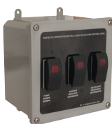
*HX-0182 Optional Remote Station