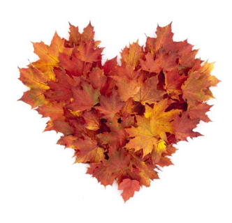
(FELLOWSHIP — Continued on page 6)