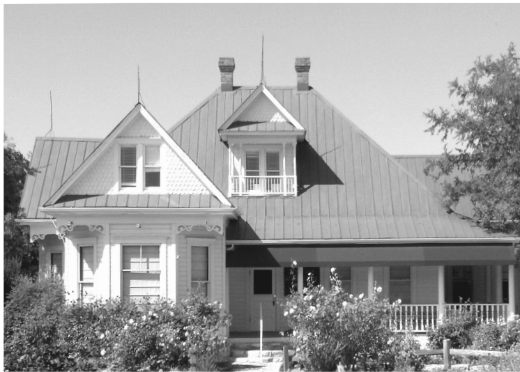
The Victorian House at The Antlers Inn

“Texas Chainsaw Massacre” souvenirs available in the Club Car Bar!