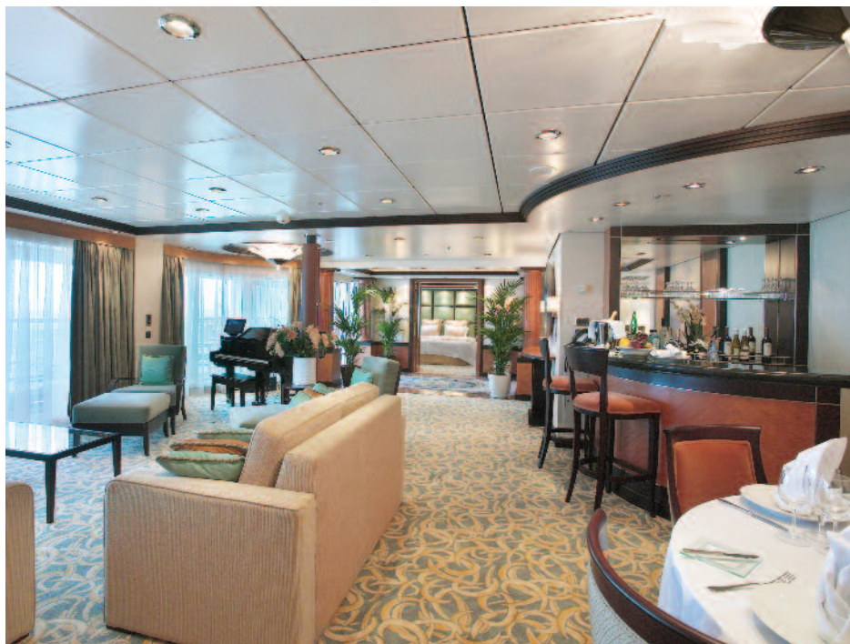
Royal Suite, Liberty of the Seas®