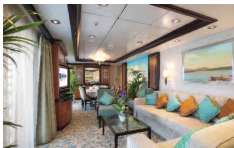
Presidential Suite, Liberty of the Seas ®

The Solarium transforms into a trendy, South Beach-styled outdoor nightclub, a true velvet-rope experience to see — and be seen. The decor is amazing, with huge, flowing white drapes, battery-powered candles and neon drinks. Plus the ship's talented DJ will be spinning the latest club tracks by the pool. (Sometimes the party even moves to the pool!) And everyone's invited to the Club Twenty after-party in the Viking Crown Lounge ® .