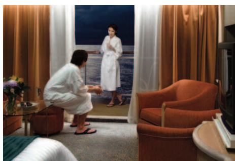
Junior Suite, Rhapsody of the Seas ®