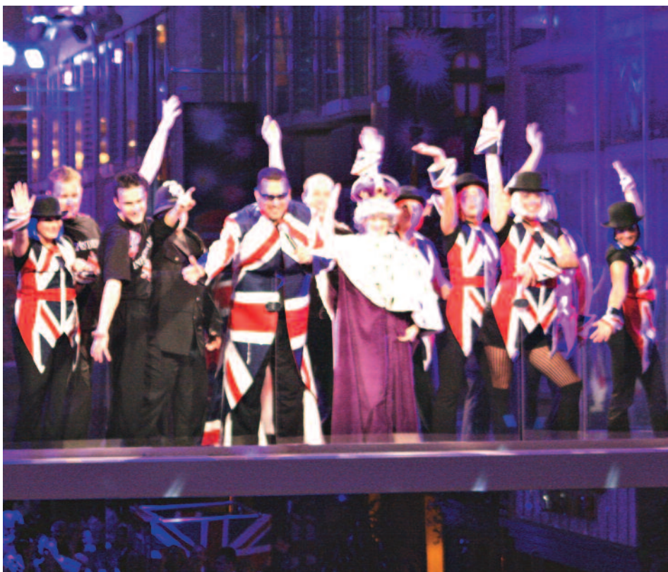
Rock Britannia on Independence of the Seas ®