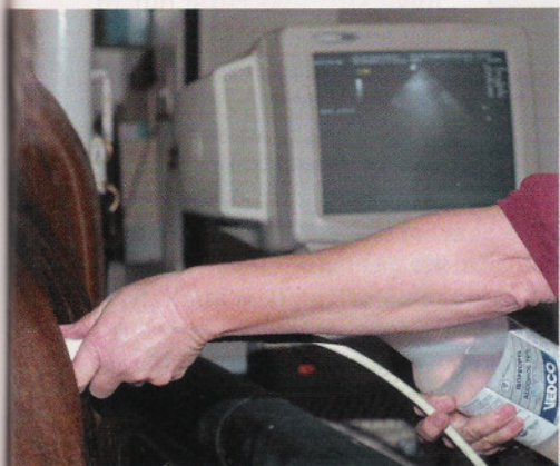
An abdominal ultrasound is part of the diagnostics for an incoming colic patient