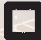
Backplate for 8", 1-Section Signal,flat

Peek Traffic warrants these products against manufacturing defects in materials and workmanship for one year from the date of shipment from the factory. Specific contracts and regional laws may alter or vary these terms.