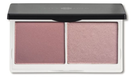
NAKED PINK ()

Matte coral, light reflecting highlighter