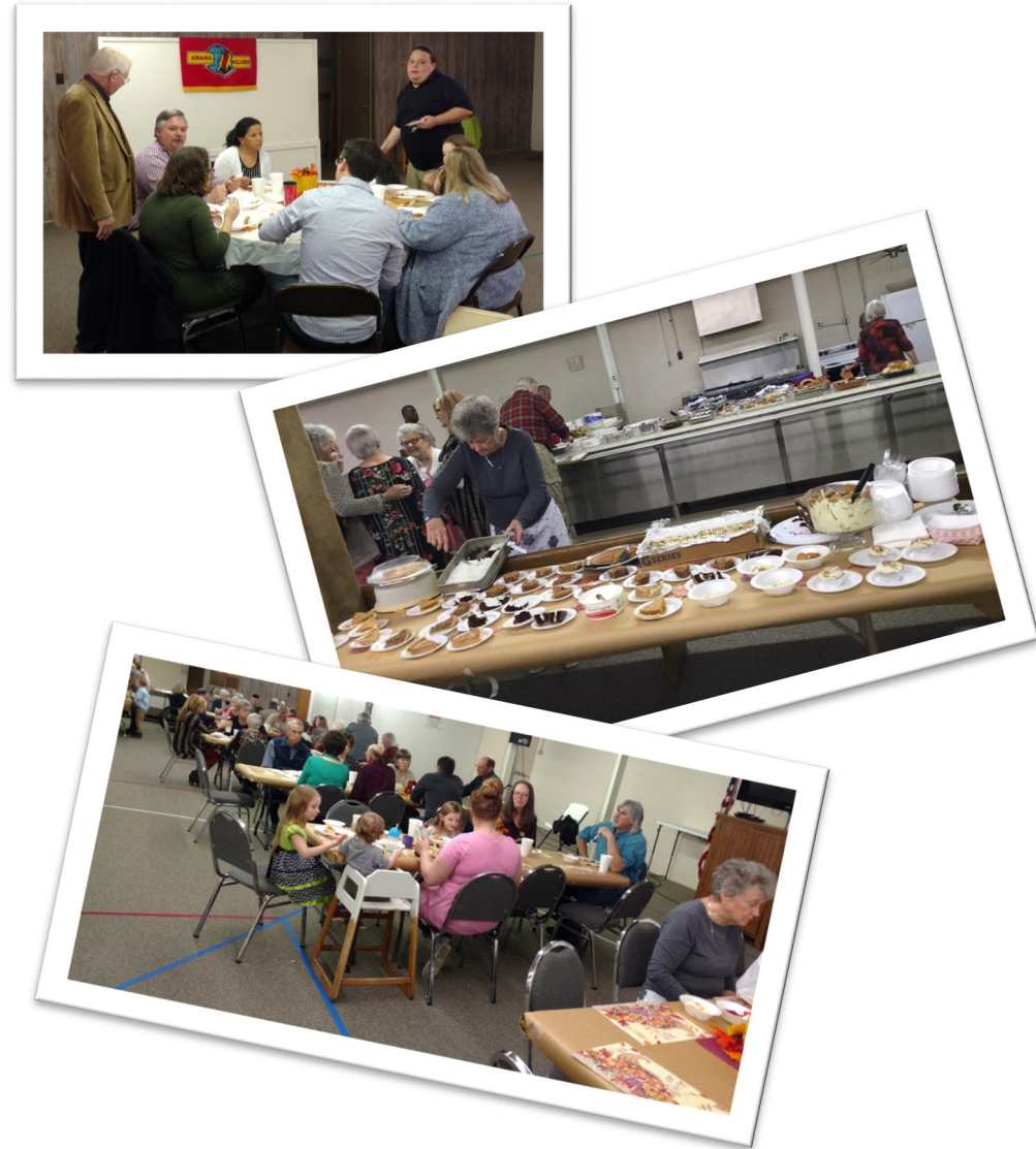
(MEAL — Continued on page 12)

On the Sunday afternoon before Thanksgiving, Marrable Hill Chapel held their annual church-wide Thanksgiving meal. Even though it was on the first Sunday of Thanksgiving Break for schools and we really missed several families due to vacations, we had a great turnout. There was plenty of food and fellowship!