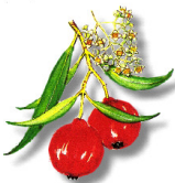
'Quandong' painted by Rosemary Pedler

Next Black & White Rag deadline Midnight FEBRUARY 29 Editor: 8846 2260 aragreen@bigpond.com