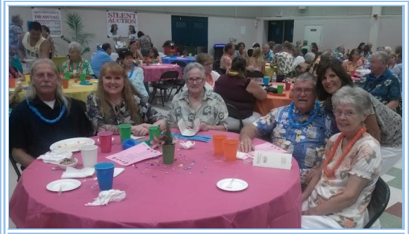
The tables soon filled up with food.