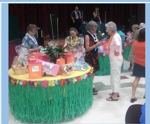
Terrific raffle prizes filled the back of the auditorium.

WHERE: Cornerstone Church at 700 Washington Avenue in Yuba City.