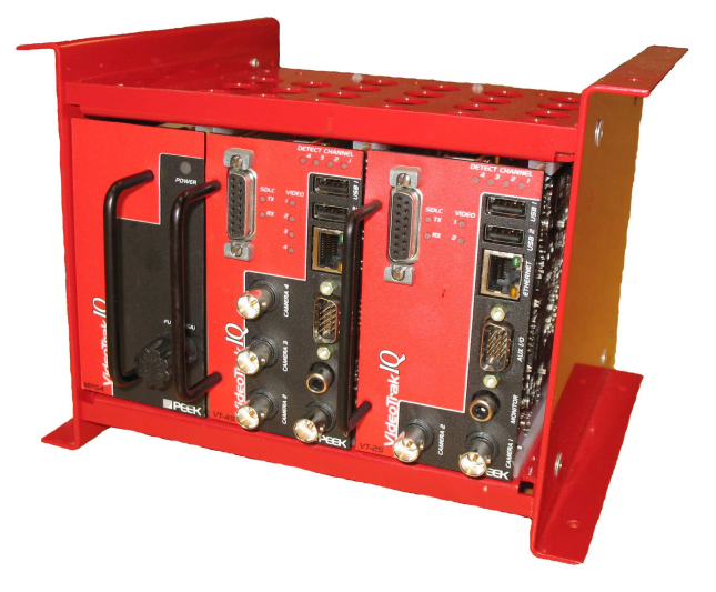
(4) Camera VideoTrak-IQ Card, in a single slot Rack with plug power pack