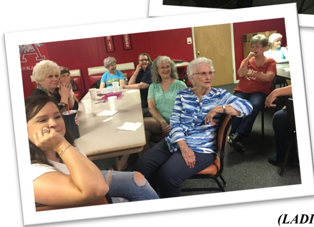
(LADIES — Continued on page 6)