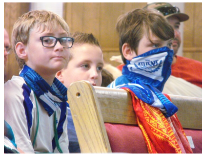
(VBS — Continued on page 10)