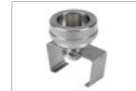
AUF1 Adaptor, 19721406 Sleeve for transmission instruments (see table at last page).