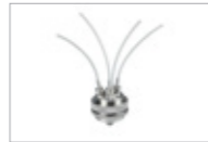
A813 Adaptor, 19721413 For reprocessing of up to 4 transmission instruments with external spray channel. To be used on A105/1 upper basket.