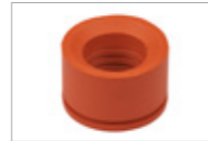
ADS3 Adaptor silicone, 19721410 Adaptor silicone for AUF1. For connection of transmission instruments with diameter of approx. 22 mm (red).