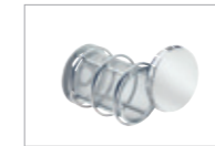
E473/2 Insert, 19721424 Mesh basket with lid for small parts. For hooking onto mesh trays. H 85, W 60, D 60 mm