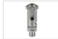
A814 Adaptor, 19721430 For reprocessing of various types of scaler tips. To be used on A105/1 upper basket.