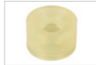
ADS1 Adaptor silicone, 19721408 Adaptor silicone for AUF1. For connection of transmission instruments with diameter of approx. 20 mm (white).