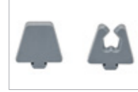
E476 Adaptor, 19721425 Adaptors for use in trays with 5 mm mesh. For transmission instruments with a diameter of 4 to 8 mm (50 per bag).