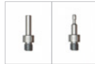
Adaptor, 06894700, 0689500 For W&H air scaler tips. For W&H Piezo and Prophylaxis tips. Can be connected to A813.