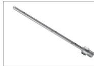
A836 Dental nozzle set, 19721451 Set of 22 injectors for A105/1.