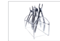
E521/2 Insert, 19721427 For 7 extraction or orthopaedic molar forceps. Compartment size 21 x 80 mm. H 135, W 100, D 189 mm