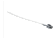
A815 Nozzle, 19721414 For the reprocessing of transmission instruments with an external spray channel. For use with A813 or A105/1 with A800 filter 4 nozzles with silicone hose.