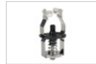
A803 Holder, 19721411 For transmission instruments (suitable for a wide range of various manufacturers) on A105/1 upper basket with A800 central filter.