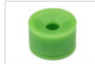
ADS2 Adaptor silicone, 19721409 Adaptor silicone for AUF1. For connection of transmission instruments with diameter of approx. 16 mm (green).