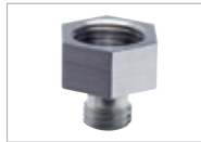
A801 Adaptor, 19721405 For use of AUF1 in combination with A105/1.