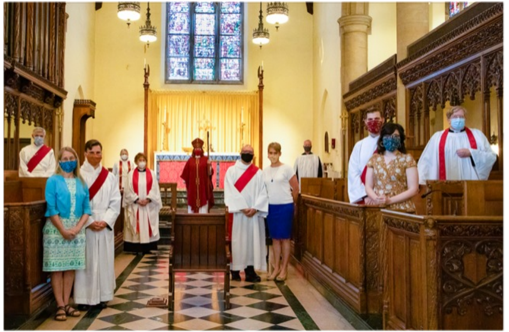
Ordination and Youth Sunday