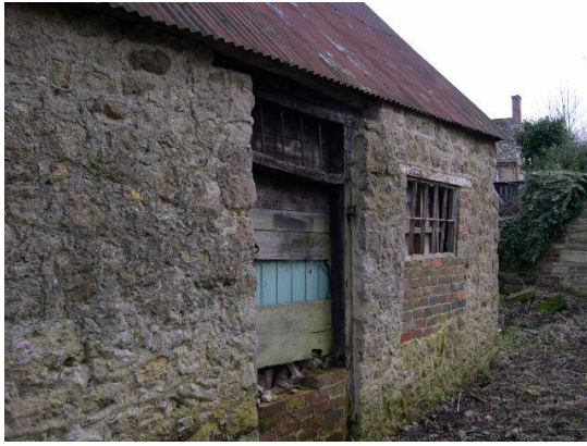
1 - Front elevation prior to work

The Slaughter House forms part of Coleshill Village and is one of the few buildings constructed before the main model village was built in the mid seventeenth century.