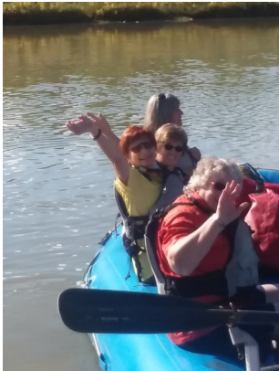
Great day for a raft trip.

This was one of the must active groups we have had since I have been in Friendship Force. Everyone was so much fun and enjoyed them all. We kept them so busy they didn't know what day it was or the time, go, go, go just like they liked it. I am very disappointed that the road to the Delicate Arch view was gashed out due to the rains the day before. This is the first time ever and not one comment. They were very grateful of everything they saw and did. A great group of people. Some of the things we did: