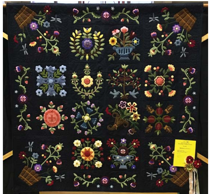
Best Theme Quilt - Norma Sims - Mammaw's Flowers