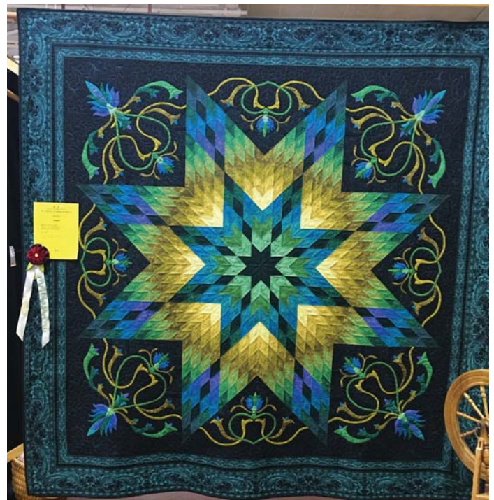
2nd place Bed Quilt Corrine Vance - Lotus