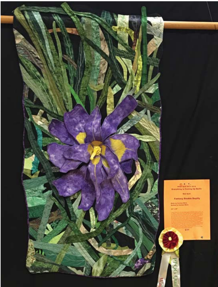
3rd place Wall Quilt - Carolyn Wells - Fantasy Double Daylily