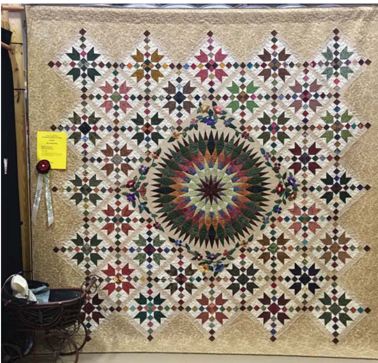
1st place Bed Quilt Corrine Vance - Encompassing