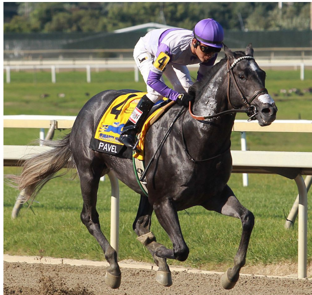
Pavel winning at Parx.

This is a somewhat sub-standard edition of the Malibu, an event won by top class sprinter Mind Your Biscuits twelve months ago, when Sharp Azteca ran second, with the Bob Baffert pair Ten Blessings and Mor Spirit rounding out the Superfecta. Still, the 2017 Malibu is interesting enough, and should be a good betting race.