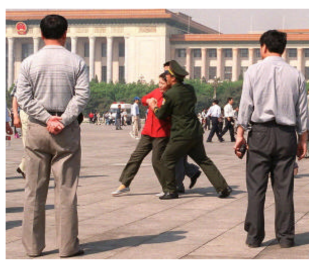
Police making arrest of Falun Gong practitioners who peacefully appeal on the Tiananmen Square on May 11, 2000.

The communist regime came into being due to neither "divine mandate" [1] nor democratic election. Today, with its ideology destroyed, the legitimacy of its reign is facing an unprecedented challenge.