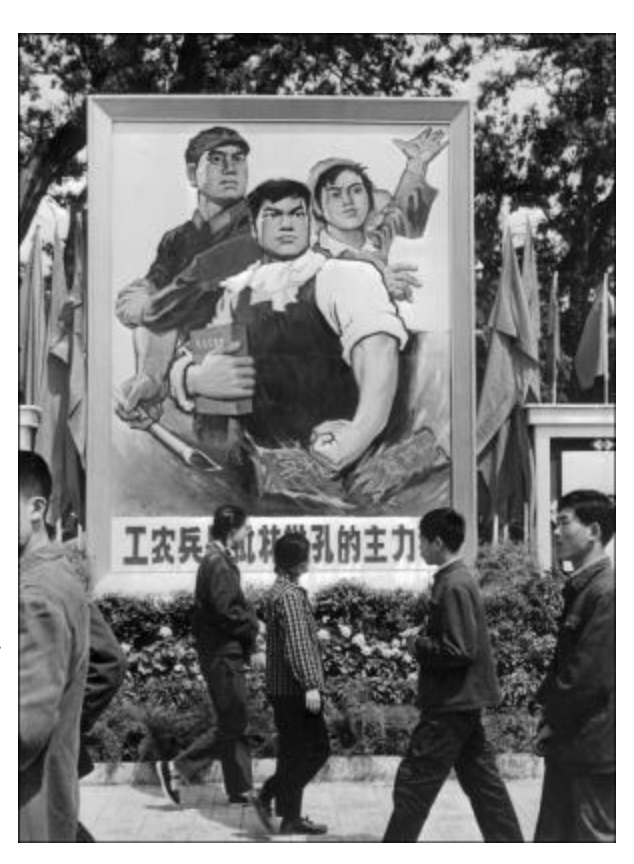
A poster from the "Criticizing Lin Biao and Confucius" campaign

The Chinese culture, believed to be passed down by God, started with such myths as Pangu's creation of heaven and the earth [1], Nüwa's creation of humanity [2], Shennong's identification of hundreds of medicinal herbs [3], and Cangjie's invention of Chinese characters [4]. "Man follows the earth, the earth follows