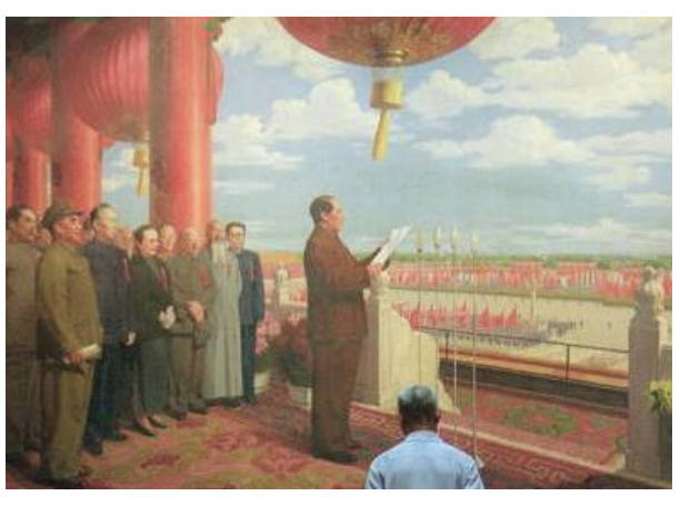
A Chinese man looks at a painting of Chinese communist leader Mao Zedong declaring the formation of the People's Republic of China on the gate of the Forbidden City in 1949. Despite the Chinese Communist Party's claims to the contrary, the history of the CCP has been filled with the blood of innocents and deceit.

According to the book Explaining Simple and Analyzing Compound Characters (Shuowen Jiezi) written by Xu Shen (d. 147 AD in the Eastern Han Dynasty), the traditional Chinese character Dang, meaning "party" or "gang," consists of two radicals that correspond to "promote or advocate" and "dark or black" respectively. Putting the two radicals together, the character means "promoting darkness." "Party" or "party member" (which can also be interpreted as "gang" or "gang member") carries a derogatory meaning. Confucius said, "A nobleman is proud but not aggressive, sociable but not partisan." The footnotes of Analects (Lunyu) explain, 'People who help one another conceal their wrongdoings are said to be