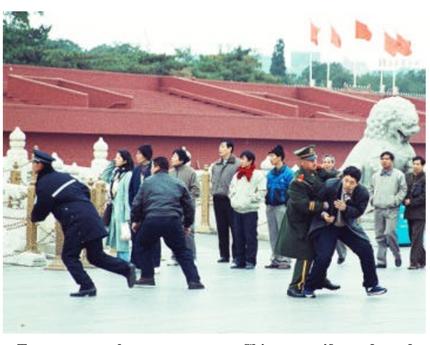
Tyranny caught on camera: Chinese uniformed and plainsclothes police arrest approximately 10 Falun Gong practitioners, who had come to Tiananmen Square to appeal peacefully for an end to the persecution, November 9, 2000.

When speaking about tyranny, most Chinese people are reminded of Qin Shi Huang (259-210 B.C.), the first Emperor of the Qin Dynasty, whose oppressive court burnt philosophical books and buried Confucian scholars alive. Qin Shi Huang's harsh treatment of his people came from his policy of "supporting his rule with all of the resources under heaven." [1] This policy had four main aspects: excessively heavy taxation; wasting human labor for projects to glorify himself; brutal torture under harsh laws and punishing even the offenders' family members and neighbors; and controlling people's minds by blocking all avenues of free thinking and expression through burning books and even burying scholars alive. Under the rule