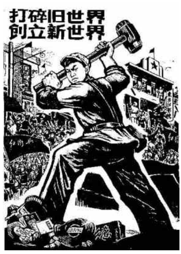
Poster promoting Red Guards' beating people, destroying properties, and raiding homes. The slogan in the picture says, "Smash the old world; build a new world."

In the last hundred years, the sudden invasion by the communist specter has created a force against nature and humanity, causing limitless agony and tragedy. It has also pushed civilization to the brink of destruction. Having committed all sorts of atrocities that violate the Tao and oppose heaven