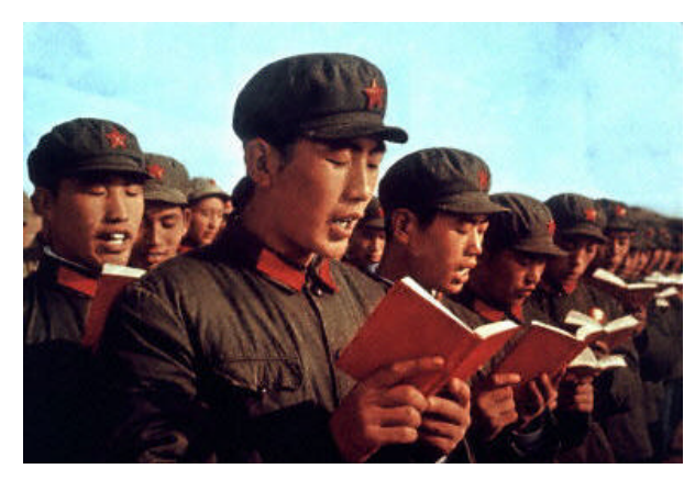
The Cultural Revolution was a time period in which "the Sun is the most red" while "the world is the darkest." Everybody had to study Mao's works.

No one in today's China, including Party members, believes in communism. After fifty years of socialism, the CCP has now adopted