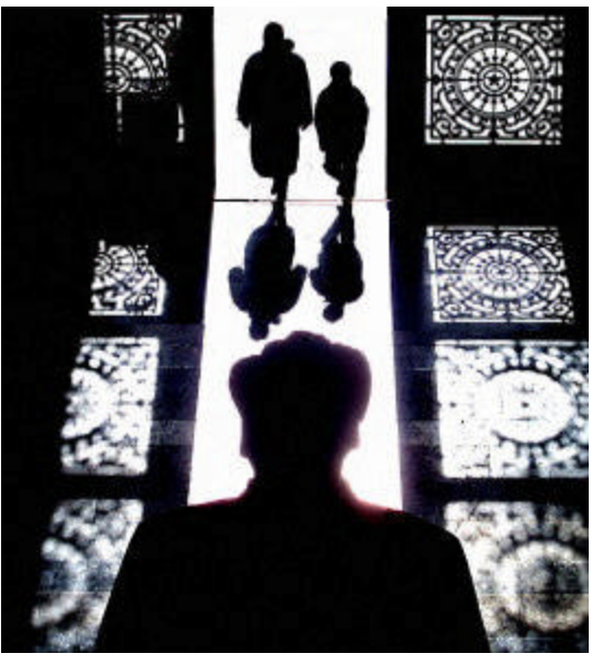
MAO'S SHADOW: A mother and son walk through the entrance of Beijing's Military Museum and are greeted by a large statue of China's former dictator Mao Zedong.

The year 1840, the year commonly considered by historians as the beginning of China's contemporary era, marked the start of China's journey from tradition to modernization. Chinese civilization experienced four major episodes of challenge and response. The first three episodes include the invasion of Beijing by the Anglo-French Allied Force in the early 1860s, the Sino-Japanese War in 1894 (also called "Jiawu War"), and the Russo-Japanese War in China's northeast in 1906. To these three episodes of challenge, China responded