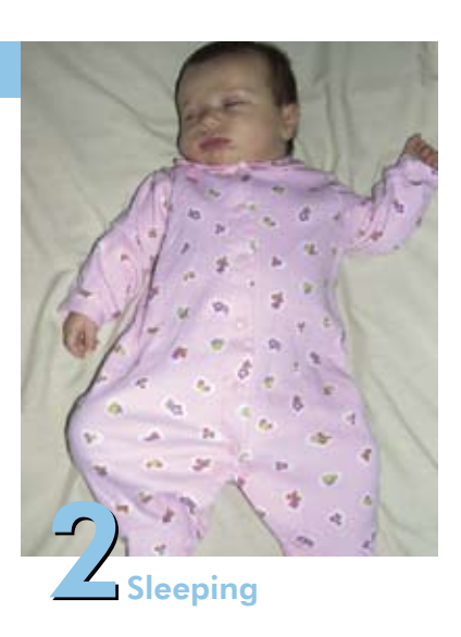
Back to Sleep, Tummy to Play