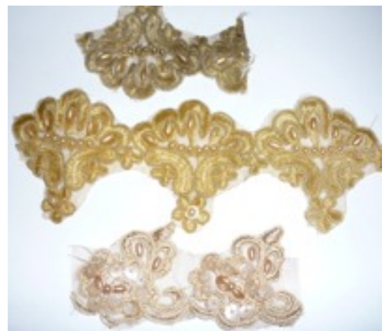
Dyed and painted lace, bottom dyed gold, middle and top painted with different golds of diluted Lumiere paint