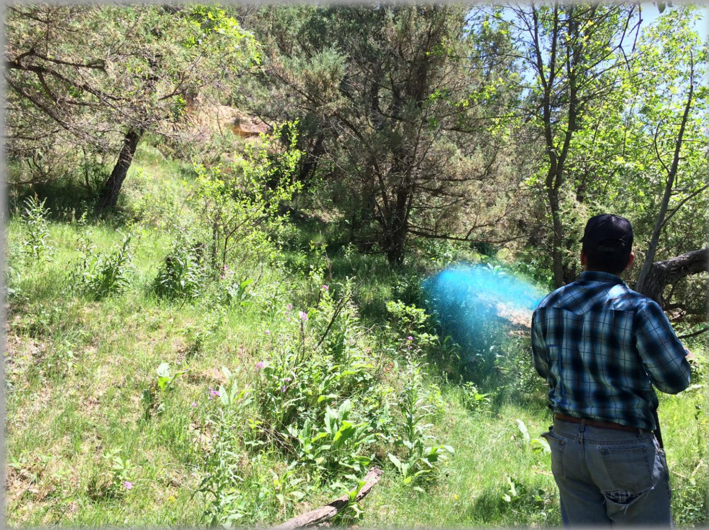
Billings County Applicator Spraying Houndstongue