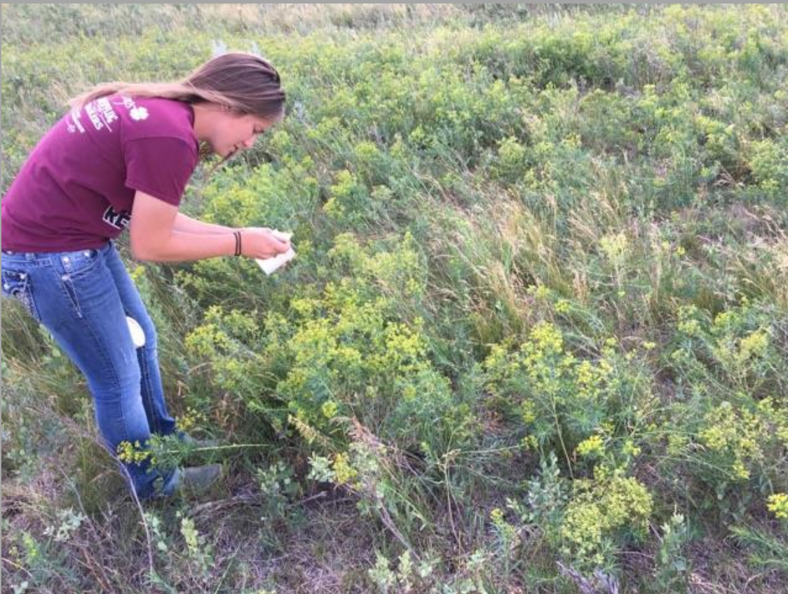
Billings County Weed Board Employee's Releasing Flea Beetles.