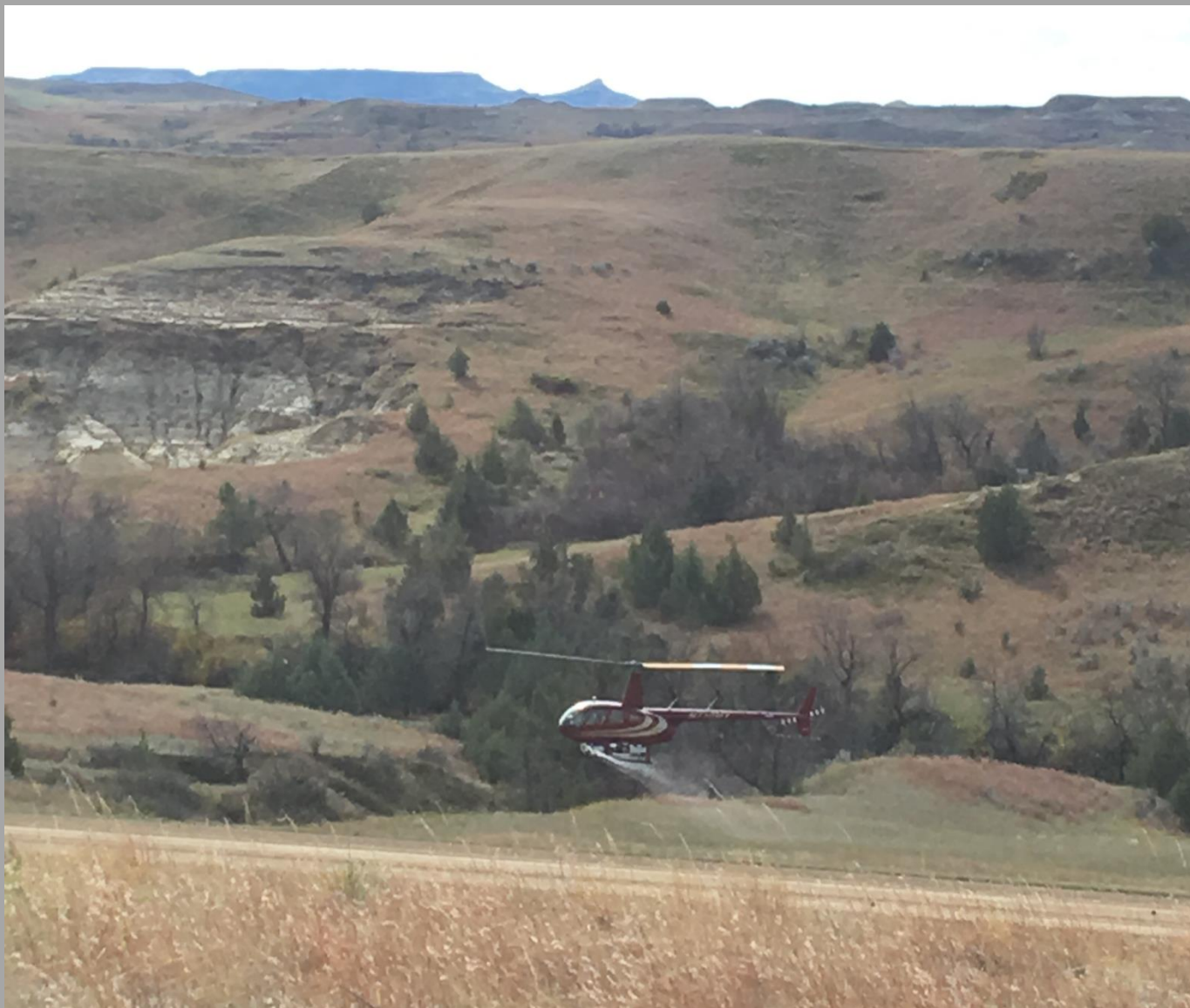
Aerial Applicator Spraying Leafy Spurge