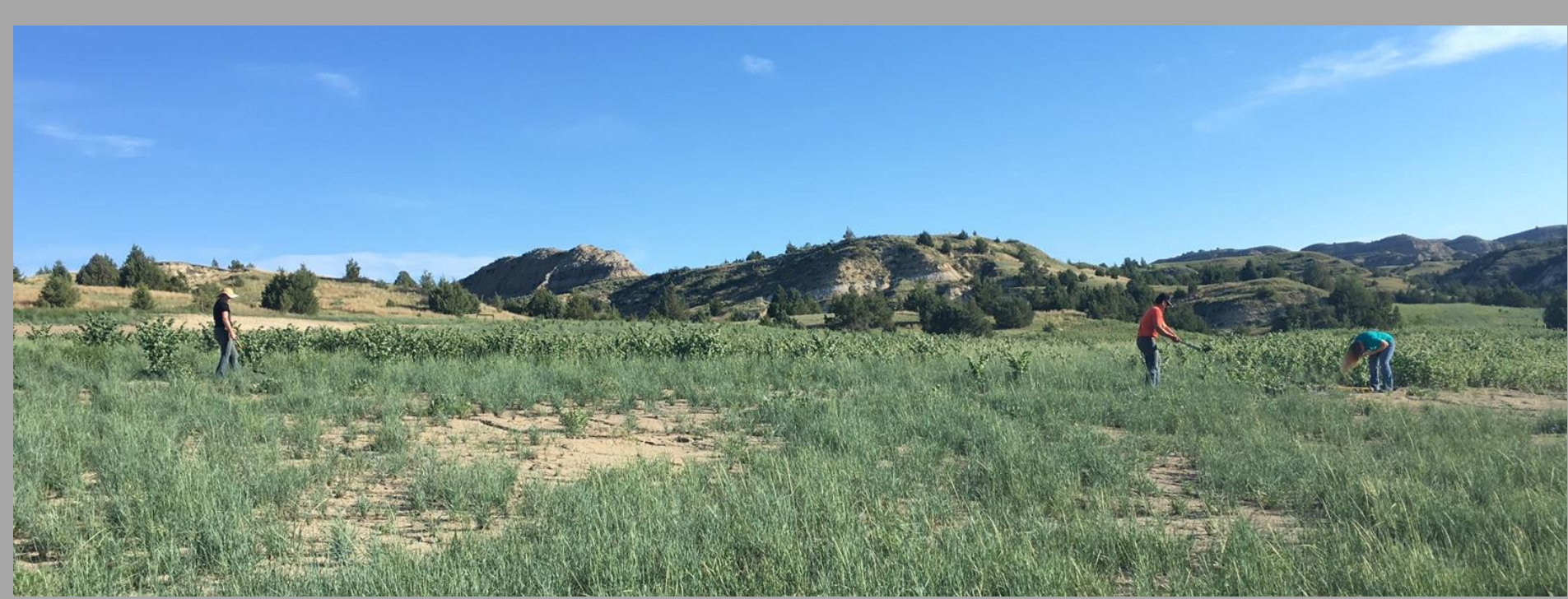
Billings County Weed Board Employee's Chopping Black Henbane.