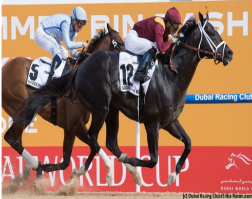
Coal Front winning the Godolphin Mile at Meydan.

COAL FRONT brings the highest Globeform rating into this edition of the Breeders' Cup Dirt Mile, a field that – admittedly – is not as strong and classy as we have seen in earlier years. The Todd Pletcher trainee is coming off a cozy win in the Parx Dirt Mile, and he should be coming up to a big performance on Breeders' Cup Saturday. Coal Front did not beat top class rivals at Parx but he did it very comfortably, and he was actually toying with the runner-up, Diamond King (who he was spotting 5lbs) down the home stretch. Diamond King headed him but when Coal Front was asked to pick it up a notch he regained command with ease. In winning by \frac{3}{4} length, full of energy, he performed to GF 116+. His best two runs to date came in the Mr Prospector over 7 furlongs at Gulfstream Park last December and the Godolphin Mile at Meydan in March, when he reeled in the local favorite Heavy Metal to win by \frac{3}{4} length. He was ridden far too aggressively when seventh to BC