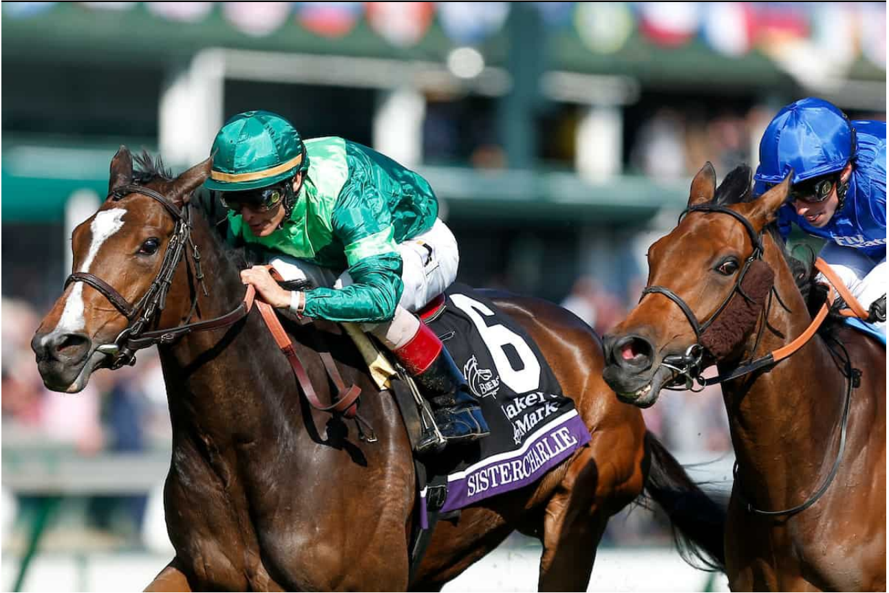
2018 BC Filly & Mare Turf: Sistercharlie proves too good, yet again.