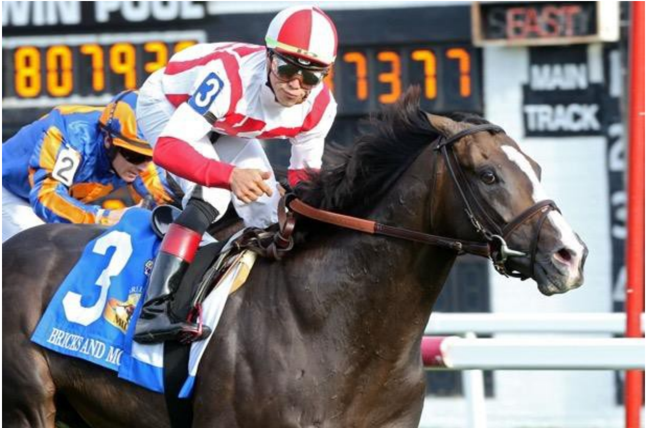
Horse of The Year candidate Bricks and Mortar winning the Arlington Million.