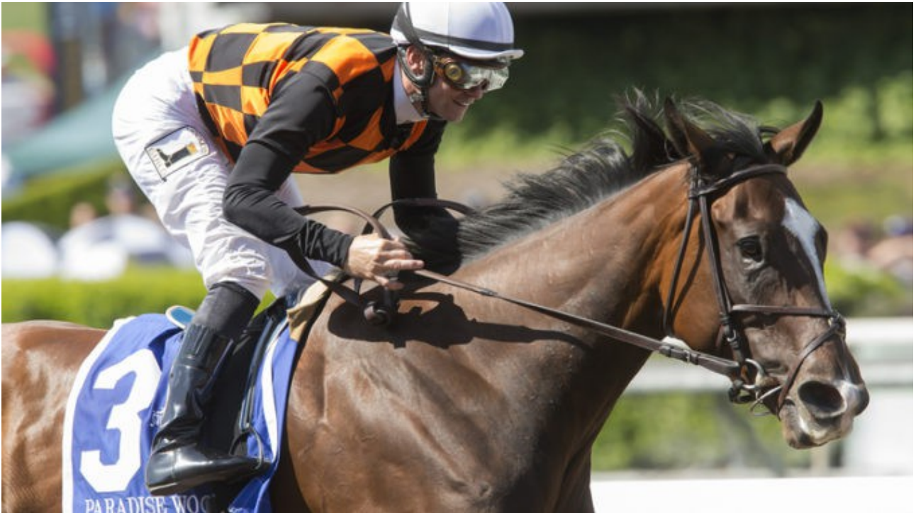
Paradise Woods, our 50-1 each-way bet for the Distaff, winning the Santa Anita Oaks as a three-year-old.