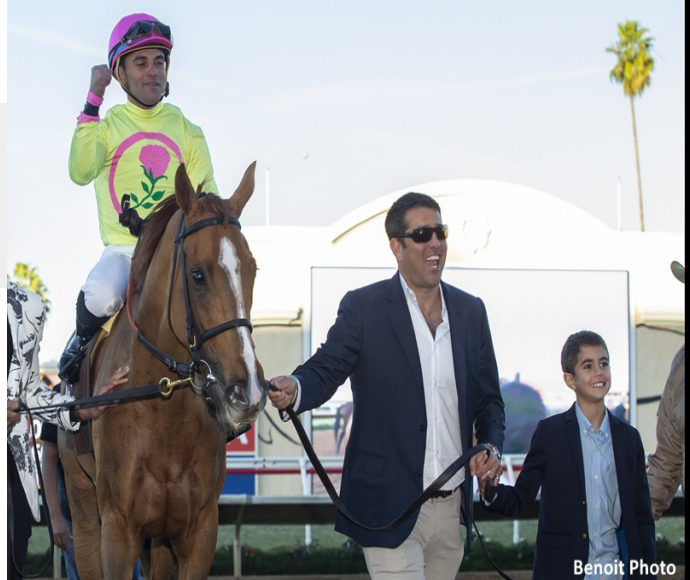
Uni coming back in after last year's Matriarch Stakes at Del Mar. Saturday could be another feast in the Sunshine State for her connections. She was recommended as a 12-1 value bet on Oct 17, and also recommended in a 90-1 double with Bricks and Mortar for the Turf.