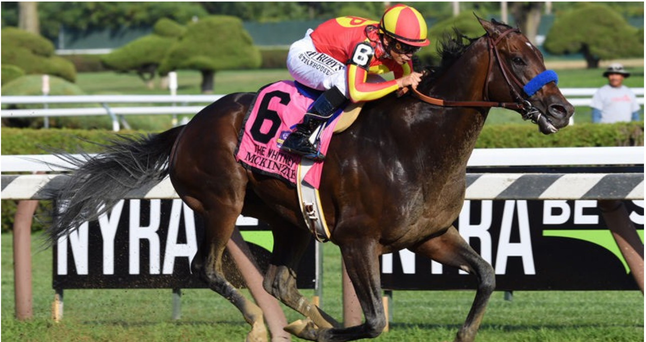
Likely BC Classic favorite McKinzie taking the Whitney at Saratoga.