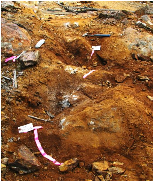
COLBY MASSIVE SULPHIDES

Sulphide mineralization consists of massive sphalerite and pyrrhotite with galena and pyrite. Pyrrhotite, and galena are also concentrated in quartzite breccia zones with sphalerite and in quartz-rich biotite gneiss, biotite quartzite, and calc-silicate gneiss. Sphalerite and pyrrhotite are disseminated in a tremolite-calcite marble. The marble is at least 300 metres thick and appears continuous over a strike length of at least 6 kilometres. Sulphide mineralization occurs within the marble unit near the centre of the claim group, and at both the northern and southern extensions.