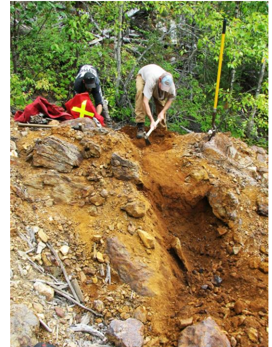
HAND TRENCHING THE CAMP ZONE ON THE COLBY MINES PROPERTY

The most significant amount of mineralization occurs in the Central Zone.