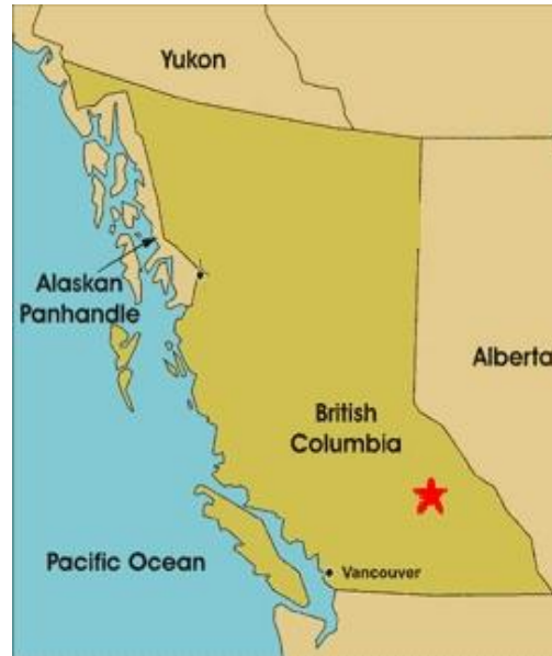
GENERAL LOCATION MAP

biotite gneiss, quartzite and marble, and calcsilicate gneiss overlain by a thick marble layer. These units are overlain by biotite gneiss and associated calcsilicate gneiss, and then calcareous hornblende gneiss & amphibolite. The rocks are indicative of upper amphibolite and/or granulite facies of metamorphism.