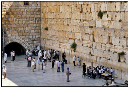
All that is left of that temple, which Rome's army destroyed in 70 A.D., is the "WAILING WALL."

T he disciples of Jesus asked him three questions: WHEN shall these things be ( the destruction of the Jewish Temple ); WHAT shall be the sign of His coming; and WHAT shall be the sign of the end of the world (MATT. 24:1-3)?