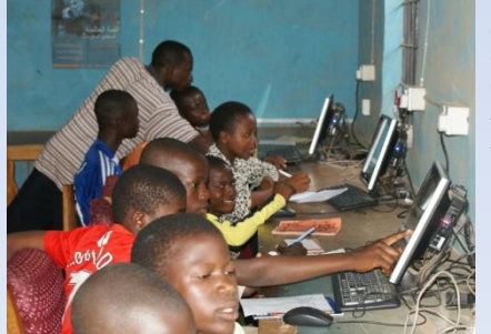
(Above) the Children's Computer Club linking kids in Kafanchan and Europe

The development of social businesses will continue to be a key strategic objective of Fantsuam Foundation in its fight against poverty and disadvantage