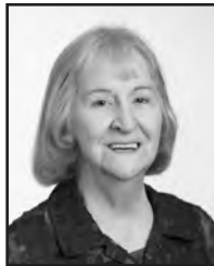
BIG TEN STATES