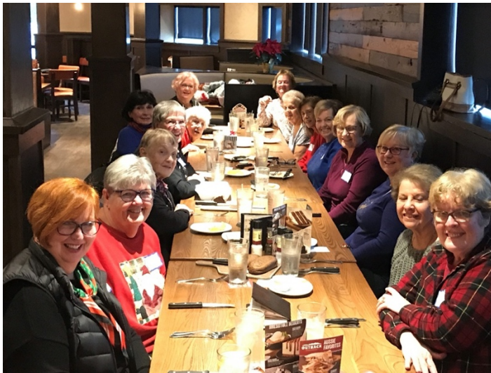
Let's Do Lunch