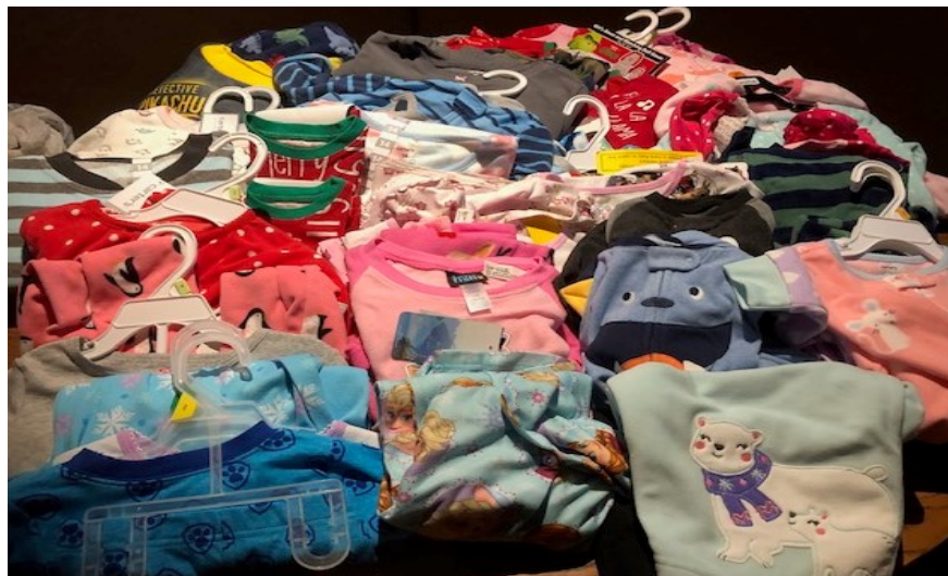
Donations- Children's Pajamas to First Step