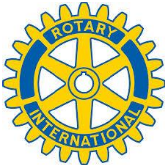
Fort Saskatchewan Rotary Club