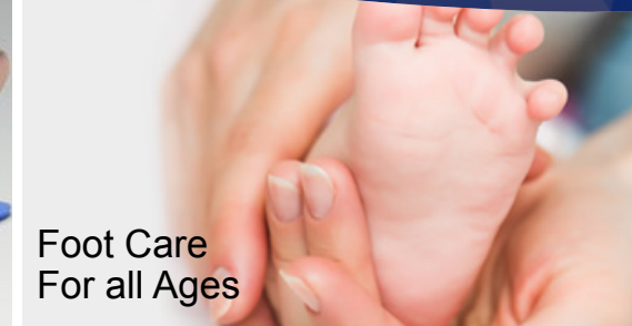
Foot Care For all Ages