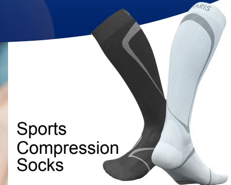
Sports Compression Socks