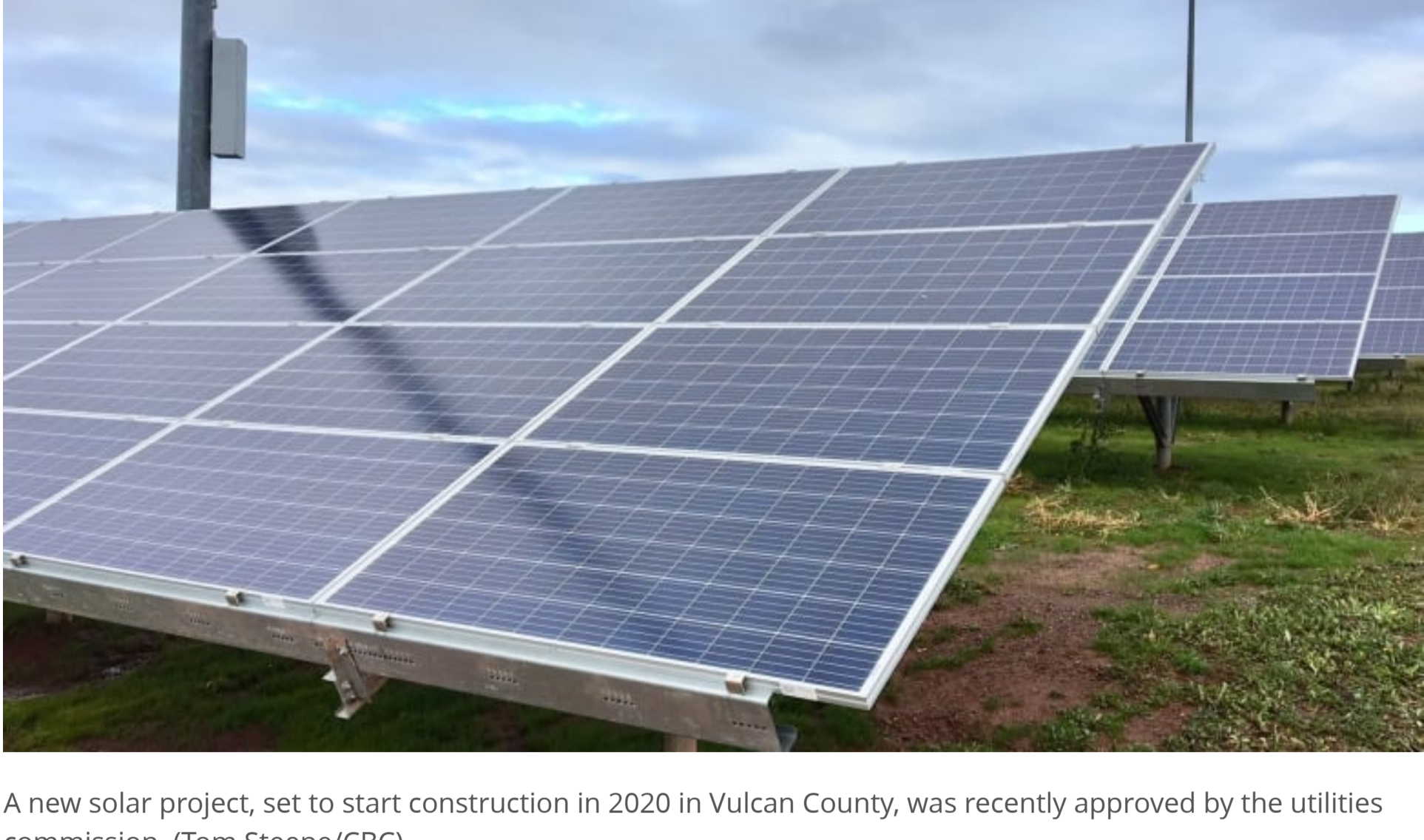
A new solar project, set to start construction in 2020 in Vulcan County, was recently approved by the utilities commission.

CBC News · Posted: Aug 27, 2019 1:19 PM MT | Last Updated: August 28