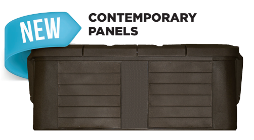
All new Contemporary Panels now available