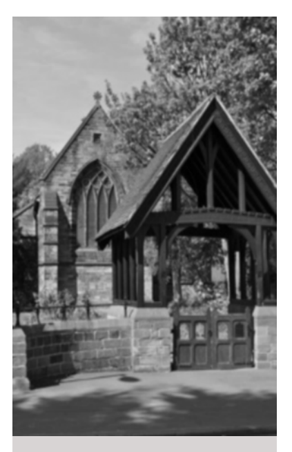
St Margaret's Parish Church Burnage