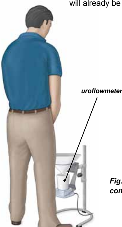
Fig. 2: A common type of uroflowmetry container for men and women.