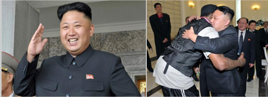
Kim Jong Un and NBA Basketball legend Dennis Rodman

"Tell Obama to call me. If you can, Dennis – I don't want to do war. I don't want to do war."