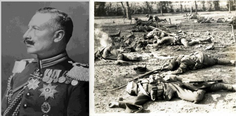
Kaiser Wilhelm II of Germany tried to avert The Great War.

"The Slavs have now become restless and will want to attack Austria. Germany is bound to stand by her ally - Russia and France will join in and then England...I am a man of peace - but now I have to arm my Country so that whoever falls on me I can crush."