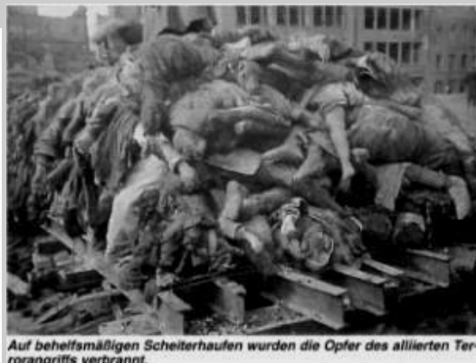
Adolf Hitler / Allied firebombing victims (Dresden)

"It is untrue that I or anyone else in Germany wanted war in 1939. It was wanted and provoked solely by international statesmen either of Jewish origin or working for Jewish interests. I have made too many offers for the control and limitation of armaments, which posterity will not for all time be able to disregard for the responsibility for the outbreak of this war to be laid on me. I have further never wished that after the first fatal world war a second against England, or even against America, should break out."