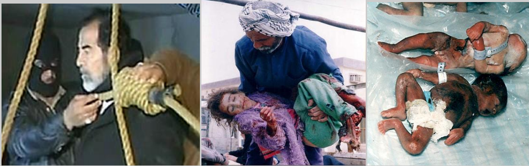
Saddam lynched by U.S. surrogates / Iraqi children and babies killed by the U.S.

"To the American people: I address you in this letter from the place of my confinement, as my attempt on the basis of my moral, human, and constitutional responsibility so that no one among you might say that no one came to you with a message of peace after the war began, refuting the arguments for it and desiring peace for you and for our upright, loyal, heroic people."