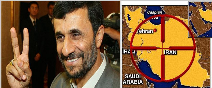
Ex-Iranian President Mahmoud Ahmadinejad also pleaded for peace

"Noble Americans, Were we not faced with the activities of the US administration in this part of the world and the negative ramifications of those activities on the daily lives of our peoples, coupled with the many wars and calamities caused by the US administration as well as the tragic consequences of US interference in other countries;