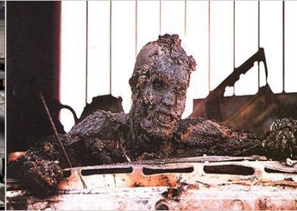
Saddam Hussein / Scenes from General Colin Powell's 'Highway of Death'

"We know that you can harm us although we do not threaten you. ....We do not place America among the enemies. We place it where we want our friends to be and we try to be friends. But repeated American statements last year made it apparent that America did not regard us as friends."