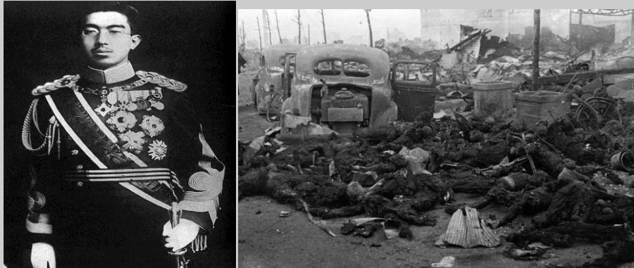
Emperor Hirohito / Charred remains of America's firebombing of Tokyo

"It has truly been unavoidable and far from our wishes that our Empire has been brought to cross swords with America and Britain.... Eager for the realization of their inordinate ambition to dominate the Orient, both America and Britain, giving support to the Chungking regime, have aggravated the disturbances in East Asia. Moreover these two powers, inducing other countries to follow suit, increased military preparations on all sides of our Empire to challenge us. They have obstructed by every means our peaceful commerce and finally resorted to a direct severance of economic relations, menacing greatly the existence of our Empire.