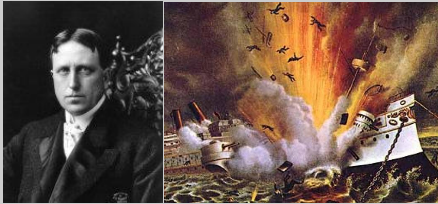
Spain's Ambassador to the U.S. Enrique de Lôme / False-Flag Bombing of the Maine

"No Spaniard would be guilty of such an act (sinking of the USS Maine). The explosion must have been caused by some accident aboard the ship."