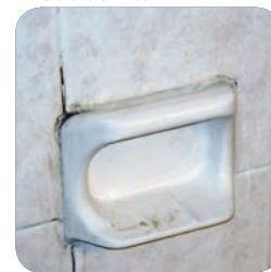
Before & After