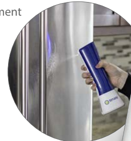
iClean mini Item #LQFC220