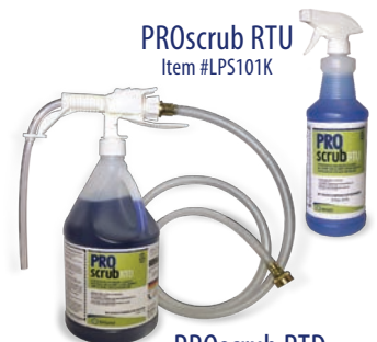
PROscrub RTU Item #LPS101K