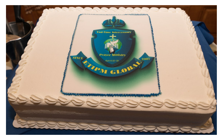
ETIPM's 10th Anniversary Celebration Banquet Cake

"Take a good look, friends, at who you were when you got called into this life. I don't see many of "the brightest and the best" among you, not many influential, not many from high-society families. Isn't it obvious that God deliberately chose men and women that the culture overlooks and exploits and abuses, chose these "nobodies" to expose the hollow pretensions of the "somebodies"? That makes it quite clear that none of you can get by with blowing your own horn before God. Everything that we have—right thinking and right living, a clean slate and a fresh start—comes from God by way of Jesus Christ. That's why we have the saying, "If you're going to blow a horn, blow a trumpet for God." 1 Cor 28:26-31 MSG