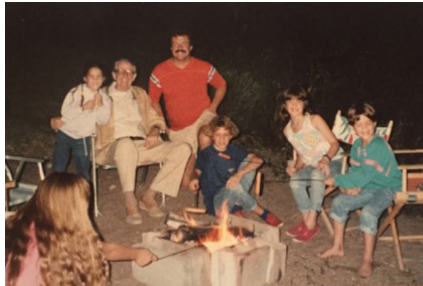
Gathered around the campfire, 1987

We see lake property legacies all over Minnesota, and the joys of "cabin living" are evident. On the west side of Pleasant Lake five generations have relished in lake living at 552 Lakeshore Circle. The present day Newberg family cherish memories as their grandparents had the foresight to buy property on Pleasant Lake.