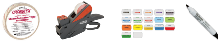
Steam Indicator Tape made outside the US.