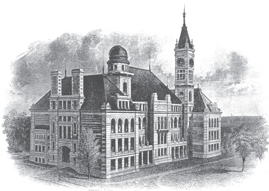
B. M. C. Durfee High School, Fall River, Mass. DEDICATED JUNE 15, 1887

Raise our praises high to Durfee, Alma Mater dear. Tow'ring high beside the river, Radiant beacon clear.