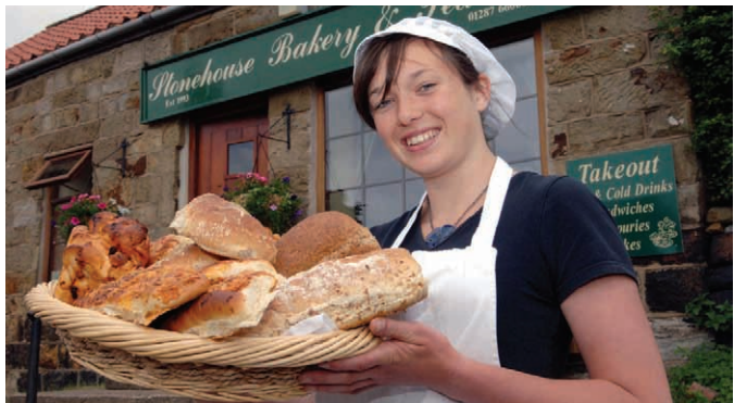
Stonehouse Bakery, Danby

and stylish setting. Our menus brim with originality, we like to start a trend rather than follow one. Lunch and dinner served Wednesday to Sunday, closed Monday and Tuesday. Booking essential.