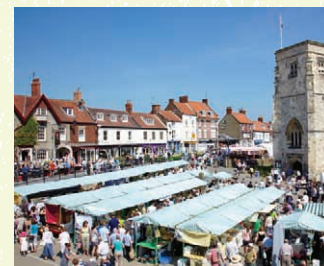
Malton Market Place

There's everything from bakery and garden produce to locally and regionally sourced fish and poultry and family run businesses selling home produced food.