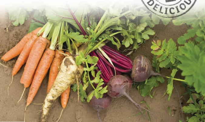
Balloon Tree Farm Shop and Café

For more information or details about any of our delicious trails, go to yorkshire.com/delicious