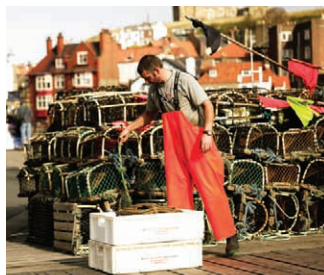
Lobster Pots, Whitby

Enjoy the unique experience of staying on a vineyard in the North of England. Ryedale Vineyards Bed and Breakfast , is a Farfield Grade II listed farmhouse which has been sympathetically restored and retains many original characteristics.